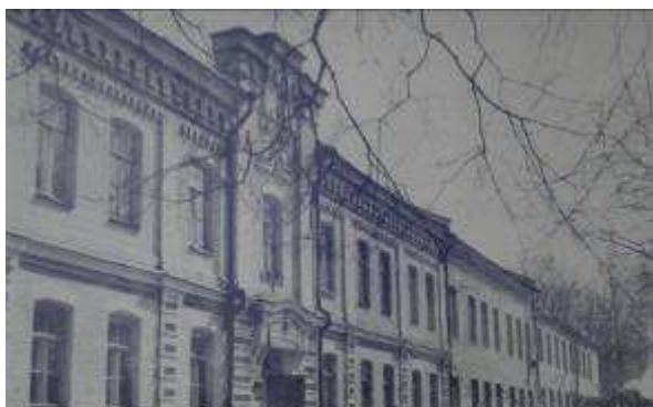
Educational building in Mainivka