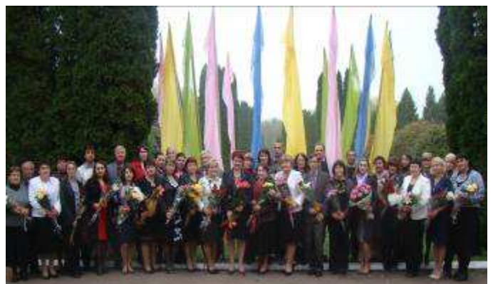
Pedagogical staff of the college

Today college lives full life and advances into future with confidence.