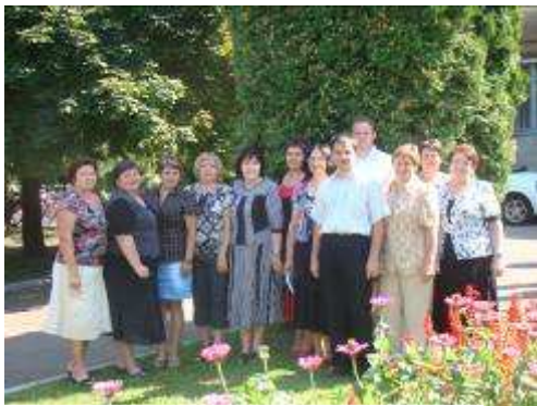
Cycle commission of general educational disciplines

At the college educational-methodological and research work is carried out by 4 cycle commissions.