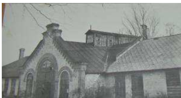
Farm. Building in Mainivka