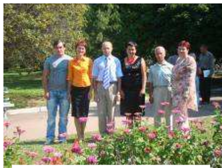
Cycle commission of socio-humanitarian disciplines

multimedia presentation of disciplines”.