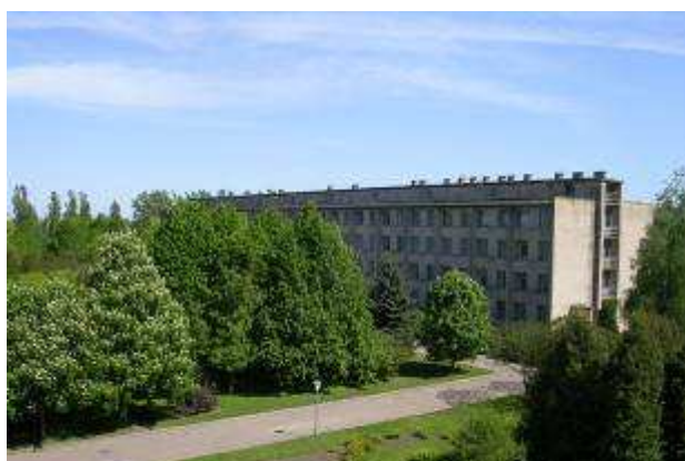
Educational building in Bobrovytsia

2008 – Separate subdivision of National University of Life and Environmental Sciences of Ukraine “Bobrovytsia